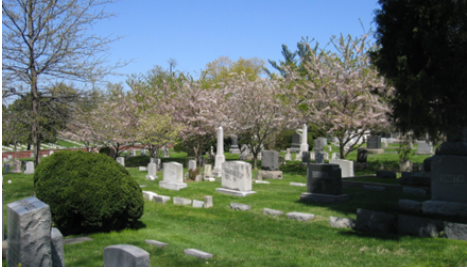
Spring in the cemetery